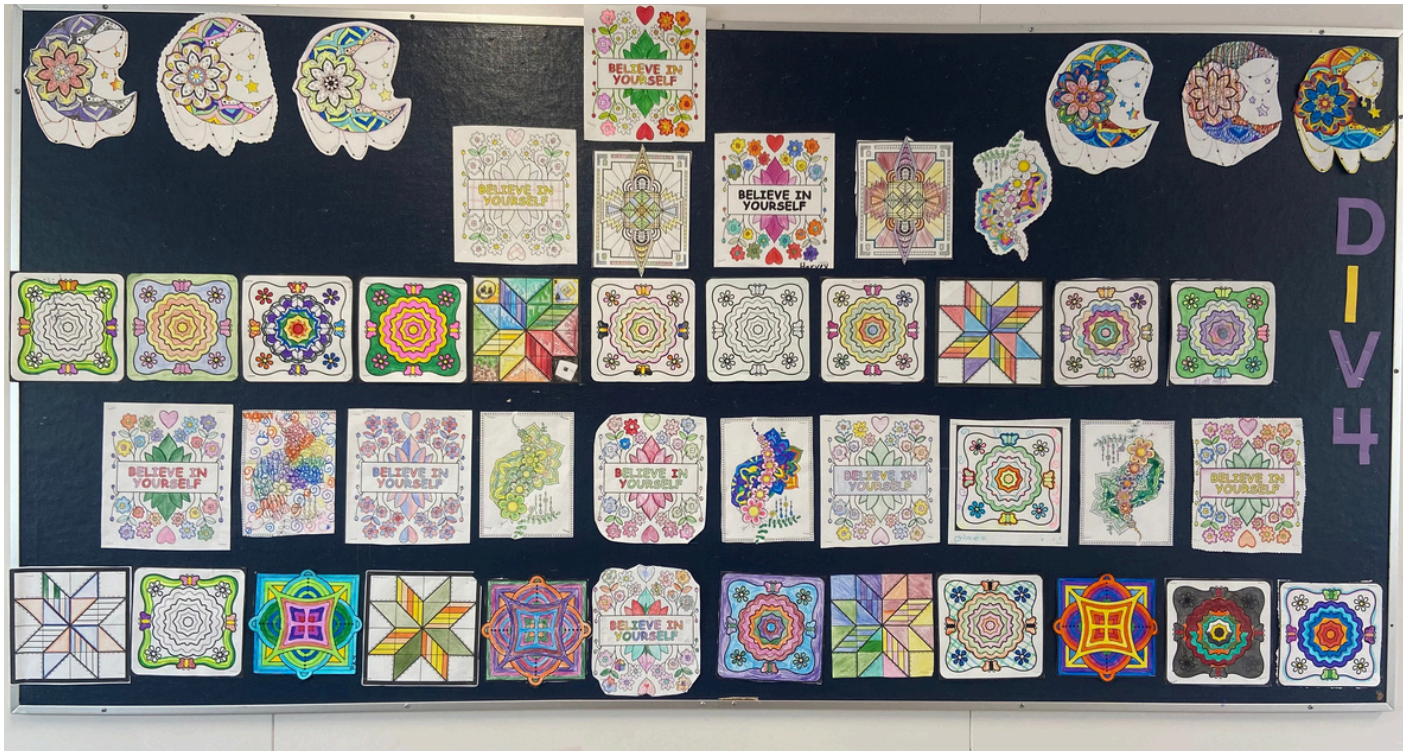
Division 4 showcasing colouring work to promote SEL.