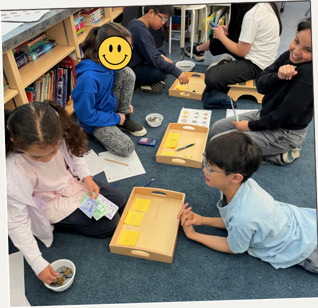
Practicing customer service skills and financial literacy - calculating and making change for transactions - in preparation for YEP Fair!