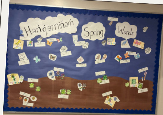
Division 17 learns about Spring through the Henqemineem language