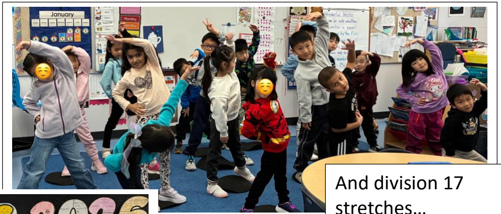
And division 17 stretches...