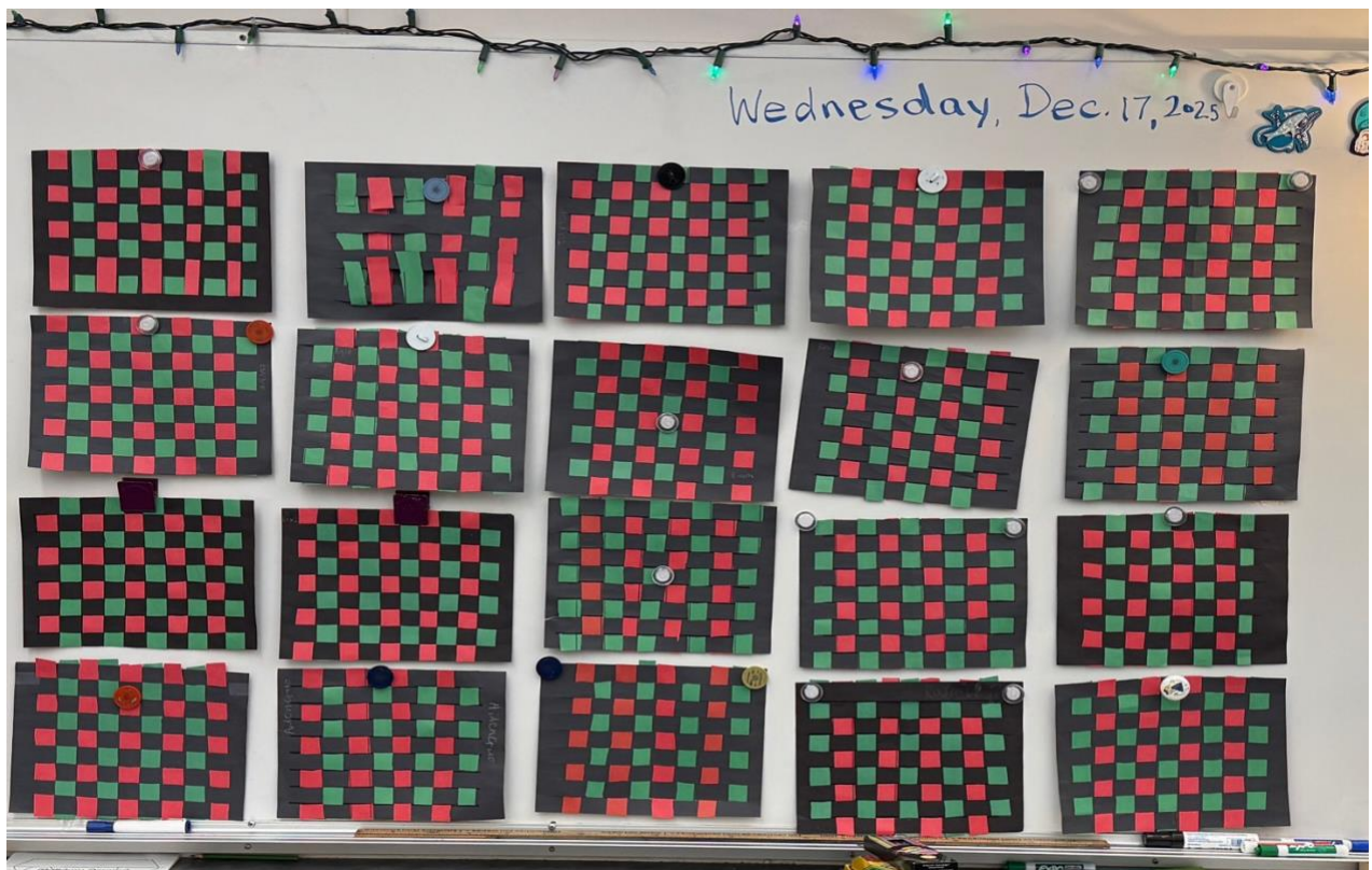
Div 11's woven Mkeka mats hold the special decorations for Kwanzaa and symbolize the foundations of traditions and history.