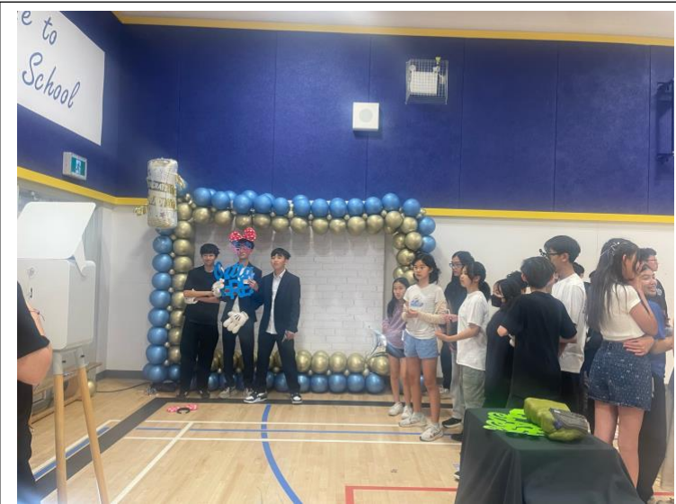
Fun at the Grade 7 Photo Booth!