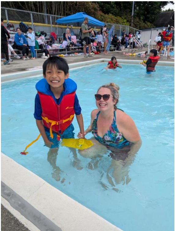
Divisions 5 – 9 went swimming!