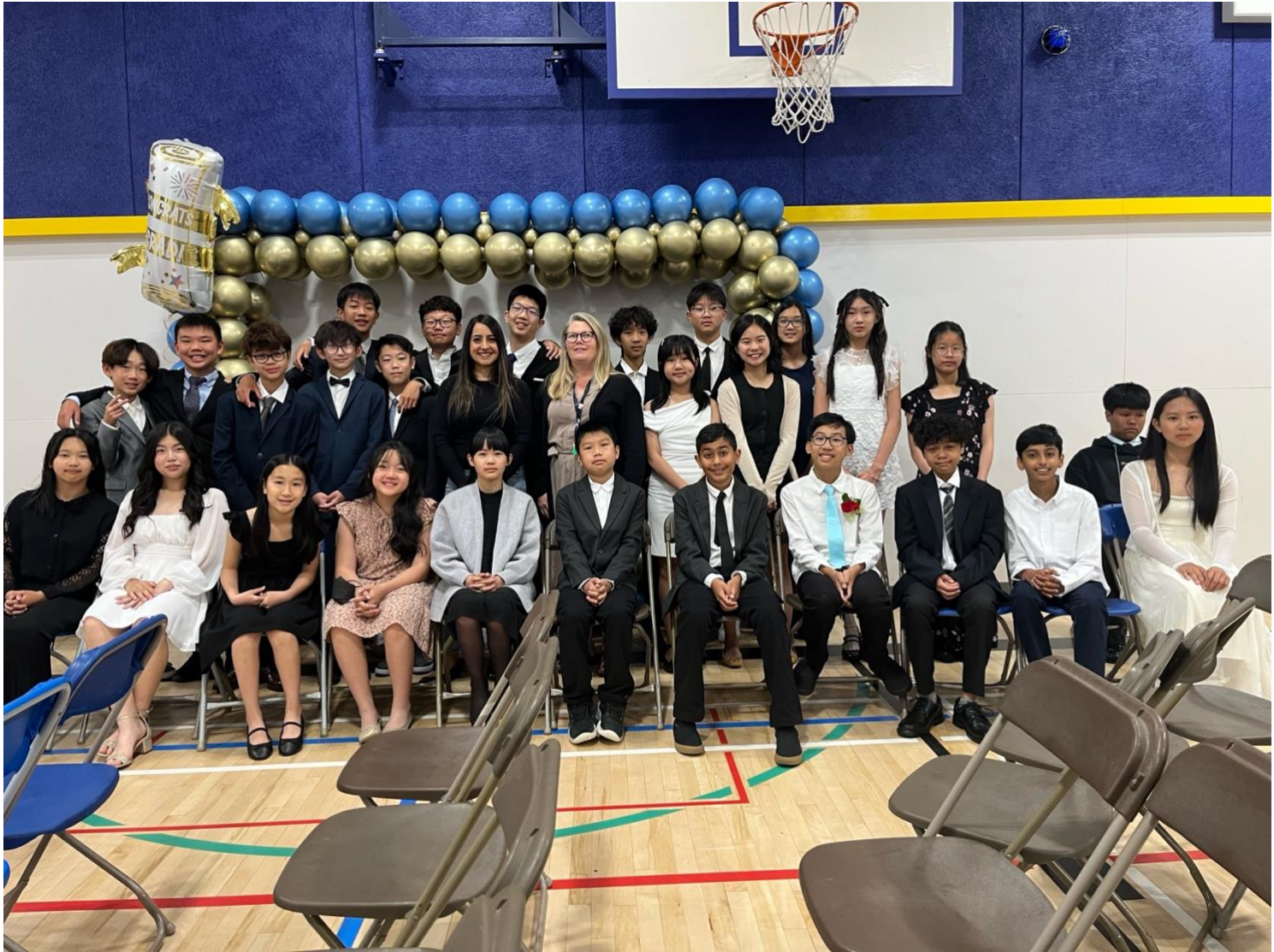
Memories with our previous teachers...