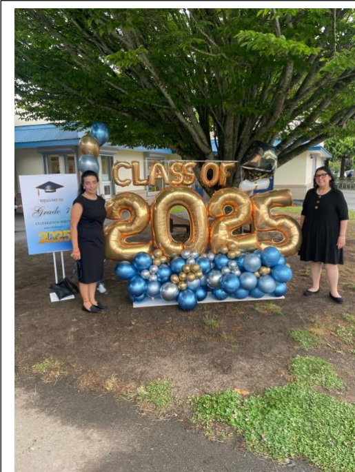
Congratulations to our Grade 7s