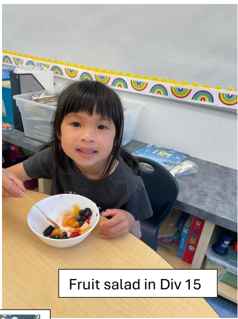
Fruit salad in Div 15