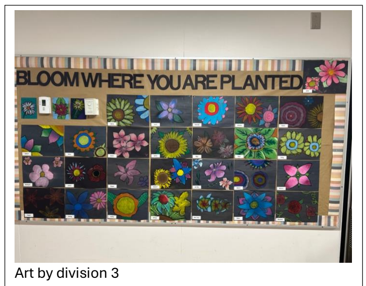
Art by division 3