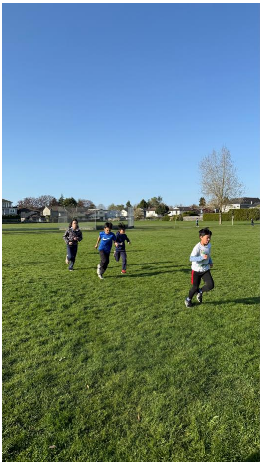
Track & Field Practice