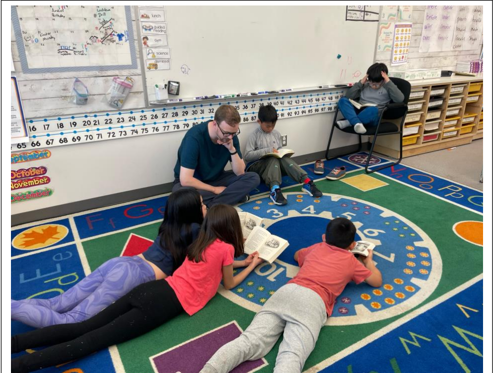
Guided Reading Groups