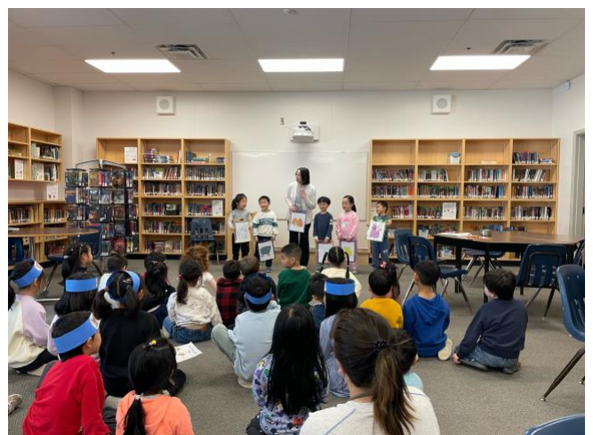
Kindergarten and Grade 1 students to Readers Theatre!