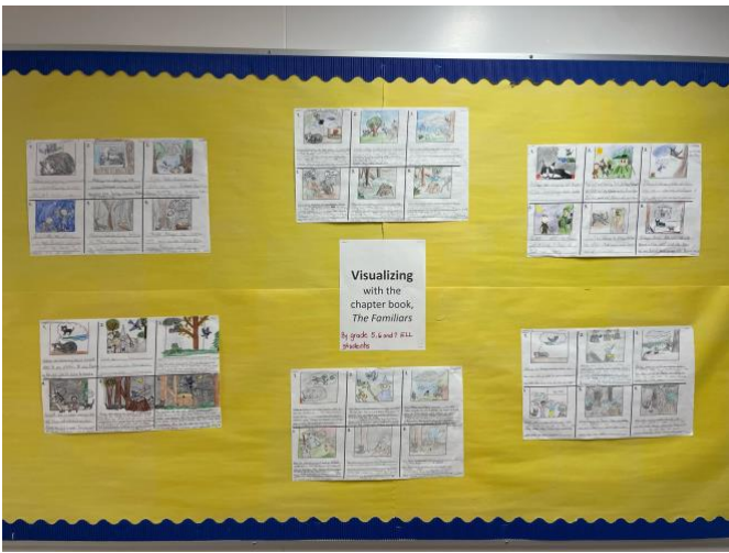
Learning about different Reading Strategies!