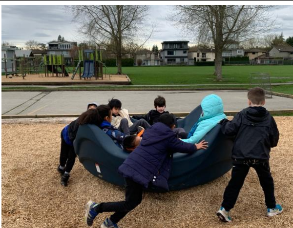
Enjoying the new playground!