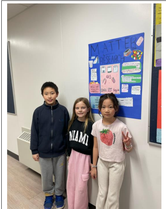
Science Projects on Matter