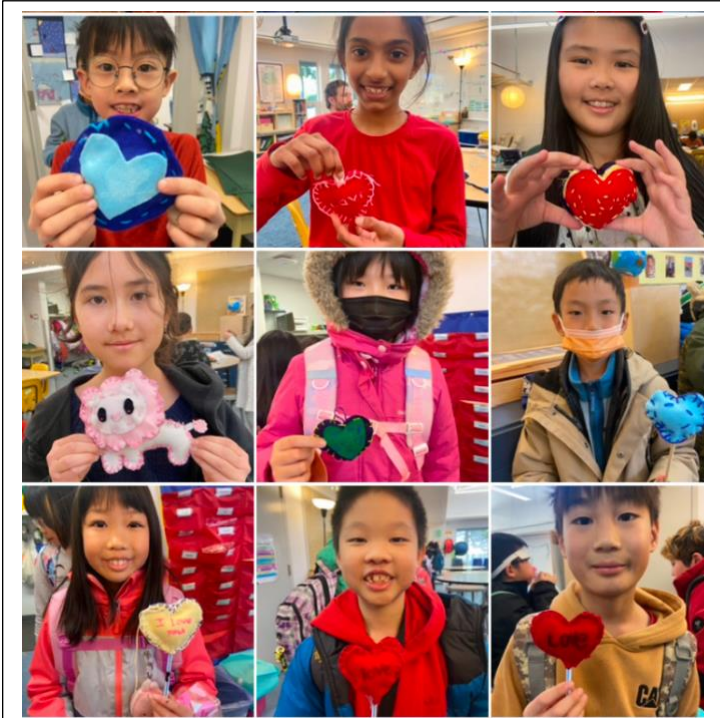
Sewing in Division 9