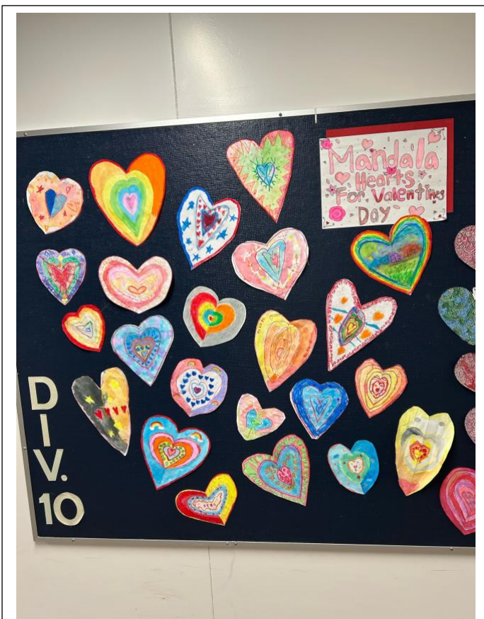
Div. 10 Art