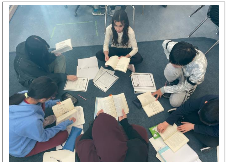
Division 5 Lit Circles