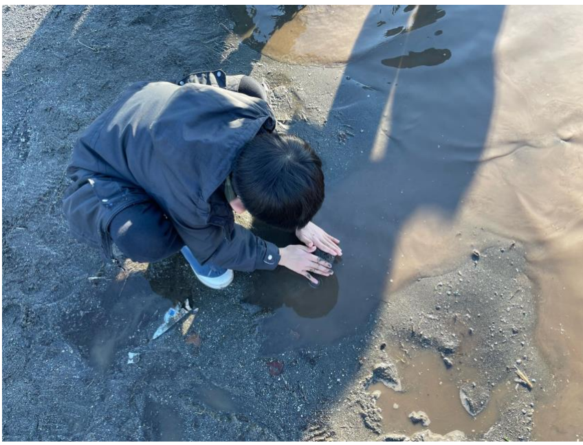
Fun at recess!