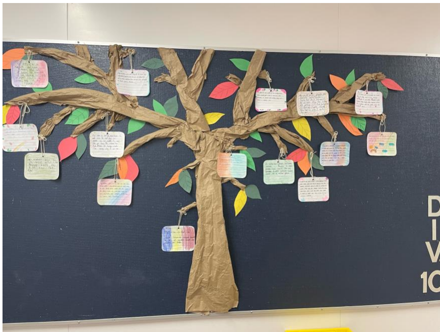
Kindness Wishes by Div. 10