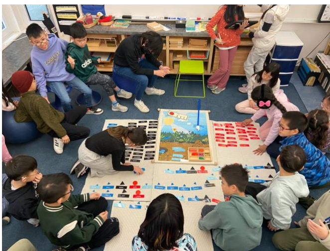
Div 9 has been exploring grammar with sentences about a backyard biome!