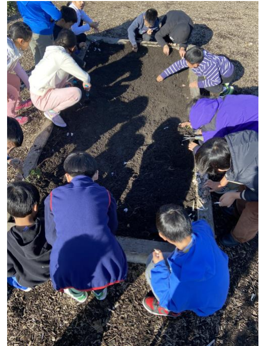
Division 9 planting garlic