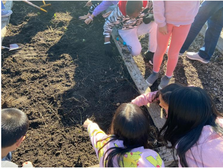
Division 9 planting garlic