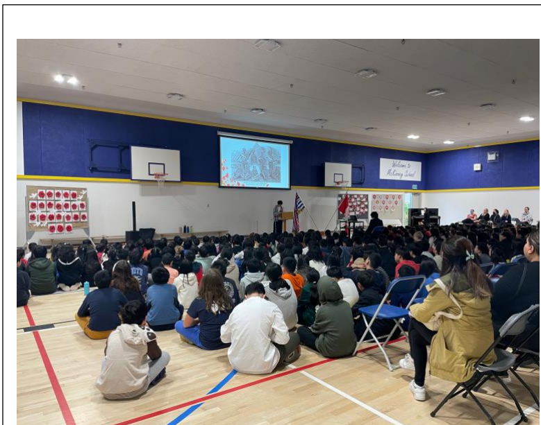
Remembrance Day Assembly