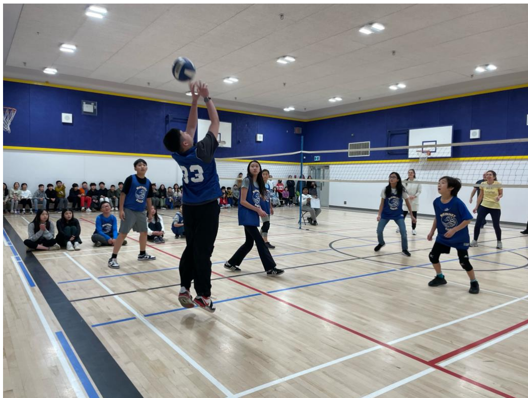
Grade 7 Student Vs Staff Volleyball Game