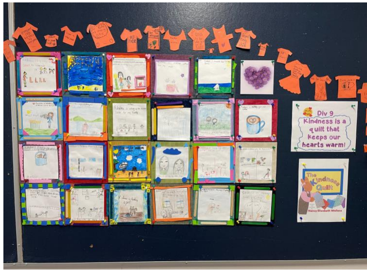
Division 9's kindness quilt