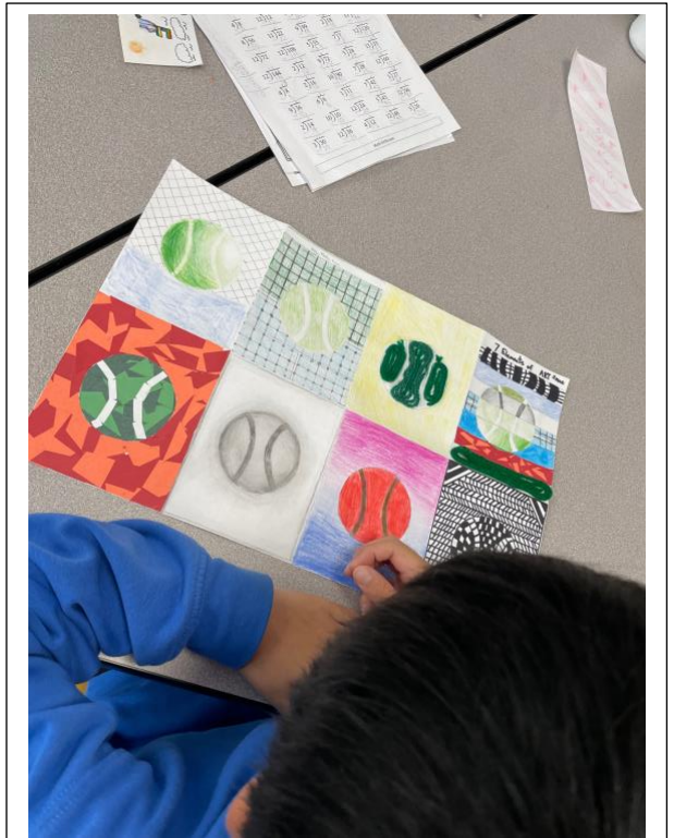
Division 4 Art