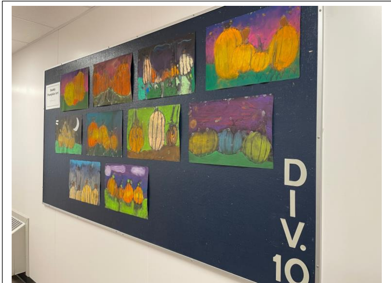
Division 10; Buddy Pumpkin Art Activity!