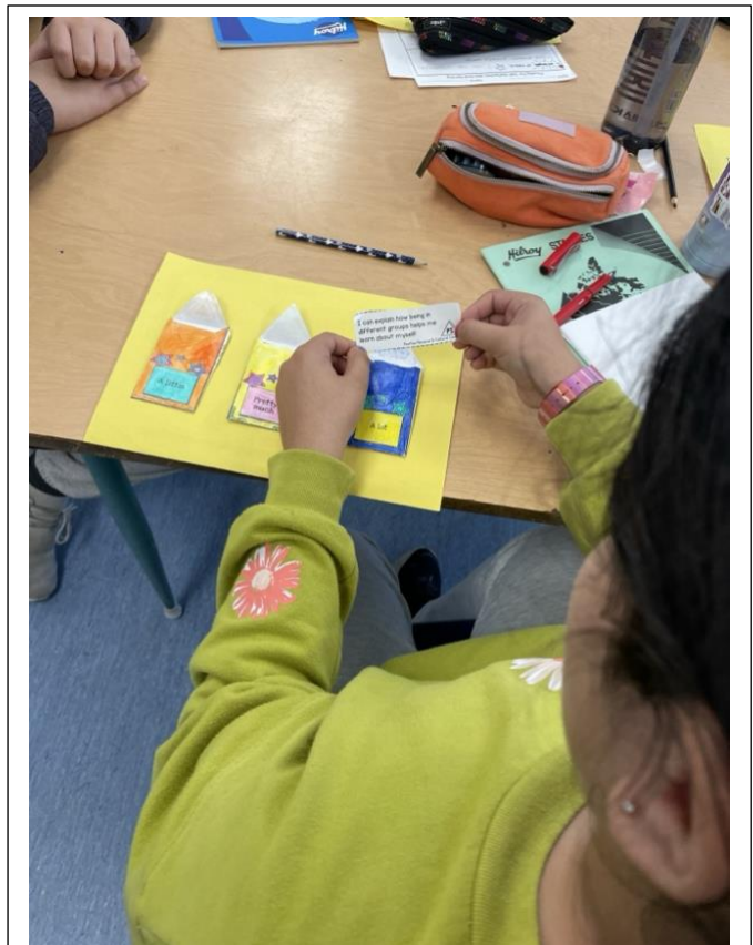
Learning about the core competencies And self-assessing.