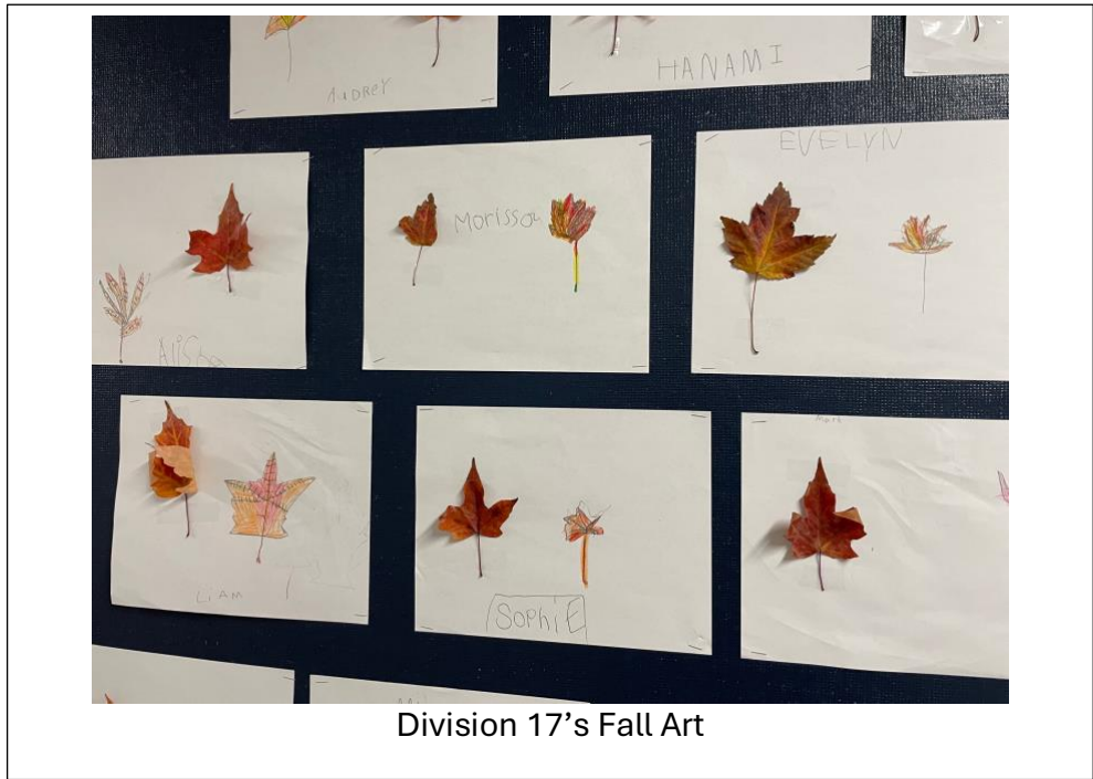
Division 17's Fall Art