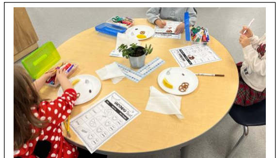
Div 15 Science!